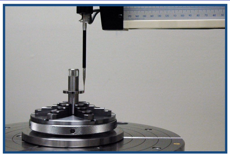
Above photo shows a dynamic verification using the Flick Standard. This procedure is a rapid verification of the probe gain and can be used daily to ensure proper system function.